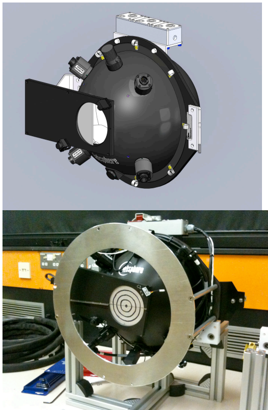
FIG. 1. (Color online): (a) CADD drawing of the ICLS head, and (b) photograph of as-built ICLS, resting in transport cradle.

600 nm), “white” LED was also installed, which could be used for non-calibrated illumination (of inside JET) from the ICLS, while the ICLS is being moved. This proved useful when rough-aligning some diagnostics. Since the calibrated tungsten-halogen bulb filaments are soft when hot (during illumination and for ~10 minutes thereafter), the ICLS should not be moved at all until the bulbs are cool, at the risk of invalidating the calibration standard of the bulb and/or destroying the filament entirely.